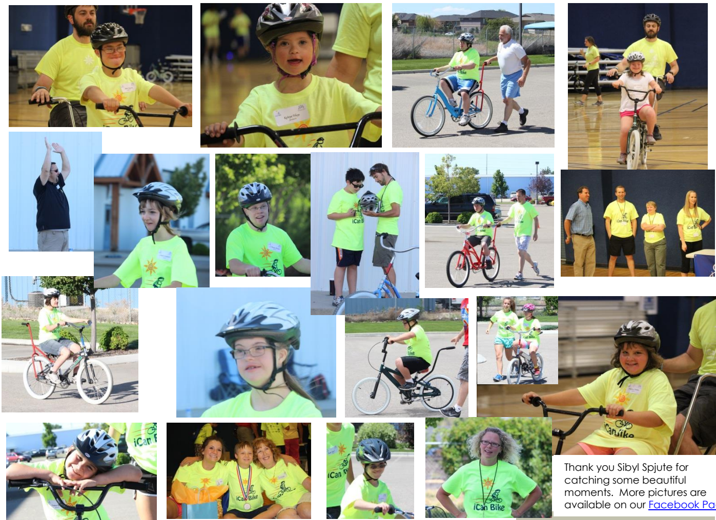
Thank you Sibyl Spjute for catching some beautiful moments. More pictures are available on our Facebook Page!